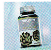
Bio-Directed™ Liver Support