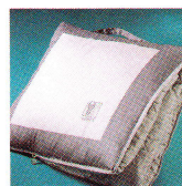
Kenko™ Travel Comforter